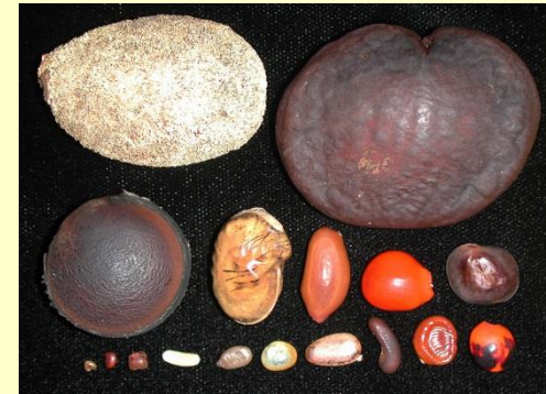
Palm tree seeds

Palm tree seeds are very light which helps them float and grow another palm tree elsewhere. Palm trees that grow by the oceans drop their seeds which can be swept great distances by the ocean's currents. Coconuts are well known travellers.