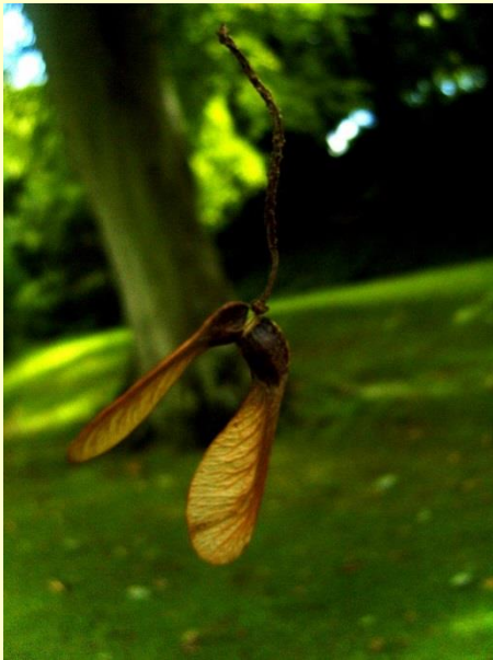
Sycamore seeds falling.

Sycamore 'helicopters' and dandelion 'clocks' both have fruits which have adapted to use the wind to carry the seeds away when the seeds are ready.