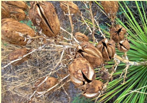
Yucca Campestris seeds

Some plants rely on being shaken to disperse their seeds. When poppies have produced their seeds and have finished flowering all that is left is a long stem with a dried seed pod. These pods have small holes at the top and rely on wind to shake them to scatter the seeds. This method doesn't send the seeds very far. Yucca Campestris seeds also need to be shaken.