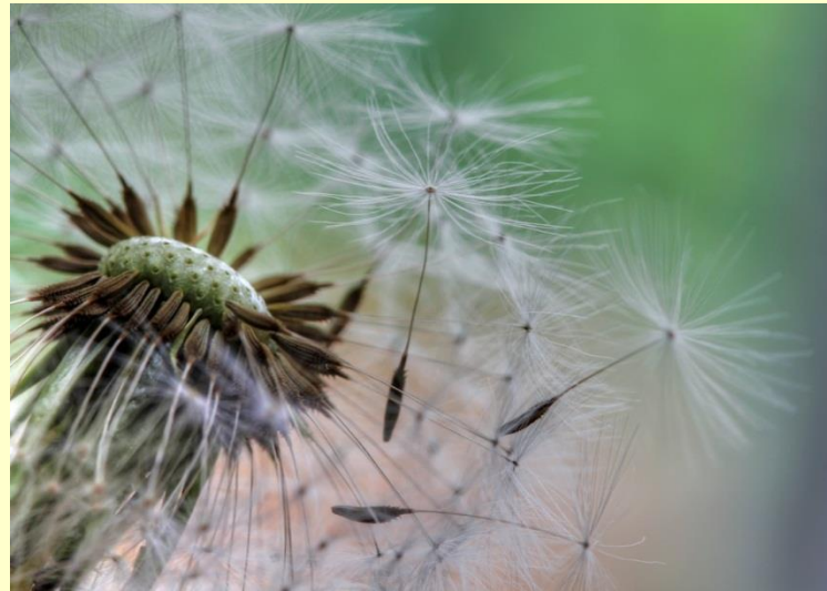
Dandelion seeds being blown by the wind.