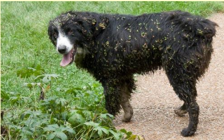
This dog has been covered in burs.

Some plants such as cockleburs have developed to grow tiny hooks on their fruits which hook on to animals (or people) that pass by the plant. Eventually they will drop off on to the ground.