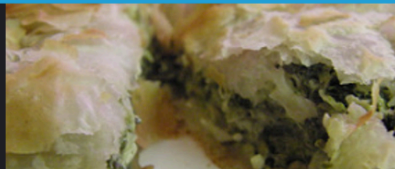
Spinach and Cheese Pie (Filo pastry filled with spinach and cheese)