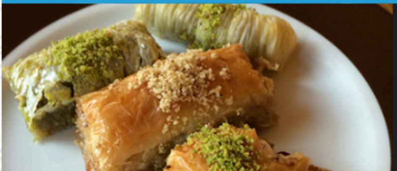
Baklava (Filo pastry, nuts and honey)