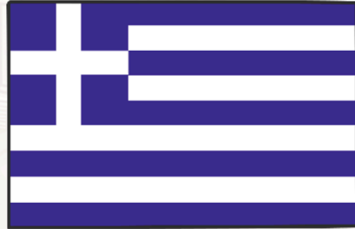
Flag of Greece (Hellenic Republic)