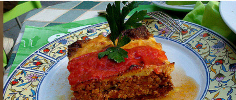
Moussaka (Minced lamb, aubergine and tomato)