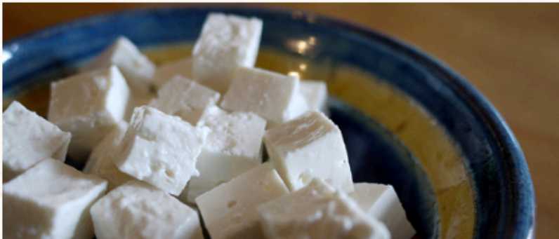
Feta cheese (Made with sheep and goat milk)

Small cafes, called Tavernas, serve delicious Greek food.