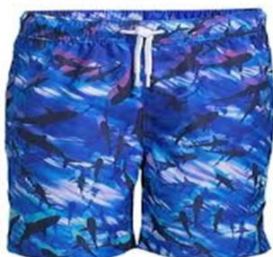
Boys Swimming Trunks. Available from Sports Direct etc