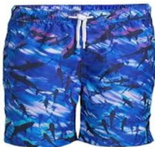
Boys Swimming Trunks. Available from Sports Direct etc