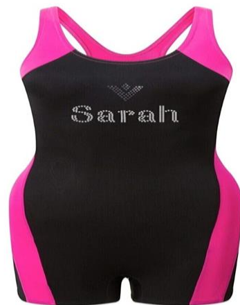
Girls Swimming costumes. Available from Sports Direct etc