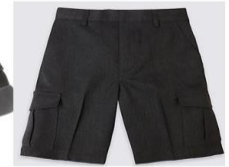
Boys may wear shorts in the summer