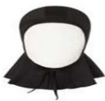
Headscarves/Hijab MUST BE Plain Navy Blue & Falling ONLY to the shoulders

Blue & White or Red & White Checked cotton dress with white leggings / tights, black school shoes. NB: Sandals or open topped shoes are NOT allowed for Health & Safety reasons