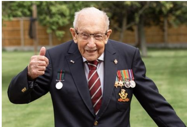
Captain Sir Tom Moore