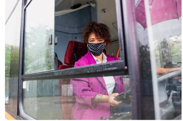
Public transport workers