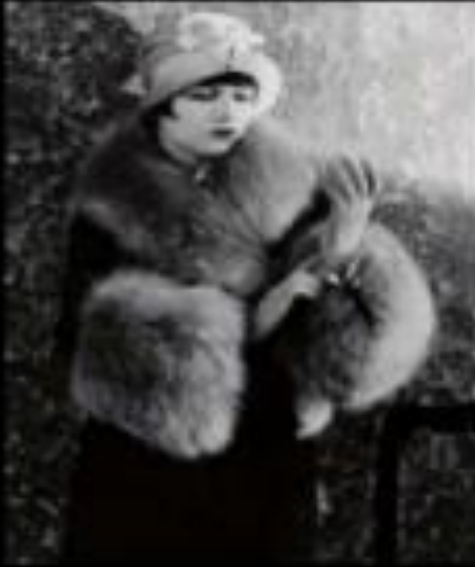
Fur coats →