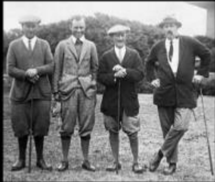
↑ Golf and tennis outfits ↓