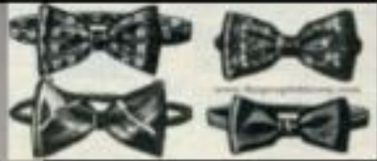
An assortment of bow ties ↑