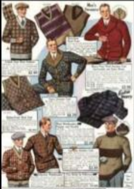
Patterned sweaters and vests →