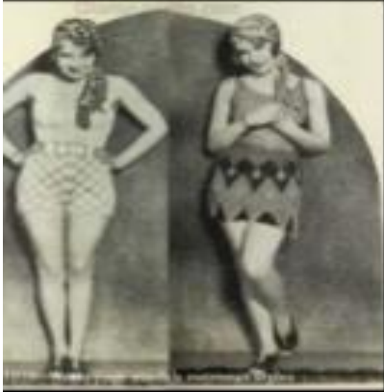
20s-style swimsuits ←