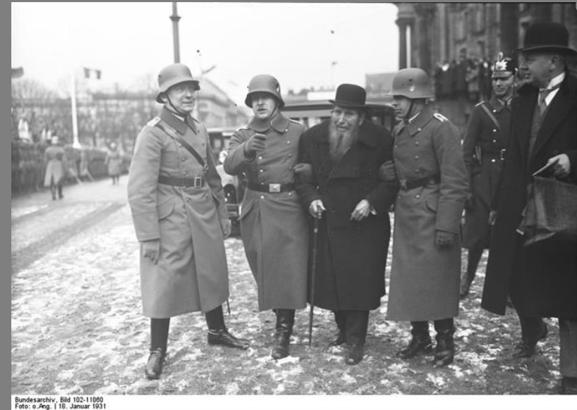
18. Januar 1931

In November 1938, a Nazi diplomat was shot dead by a Jew in Paris. Hitler ordered a seven day campaign of terror against the Jews in Germany to be organised by Himmler and the SS, who were Hitler's most feared black-uniformed troops. On the 10th November, the campaign started. 10,000 shops owned by Jews were destroyed and their contents stolen.