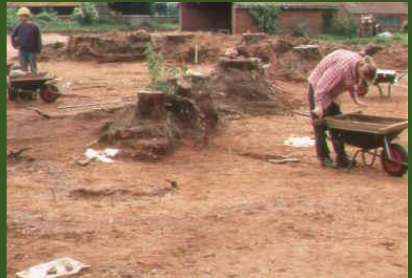
Archaeologists in 2000