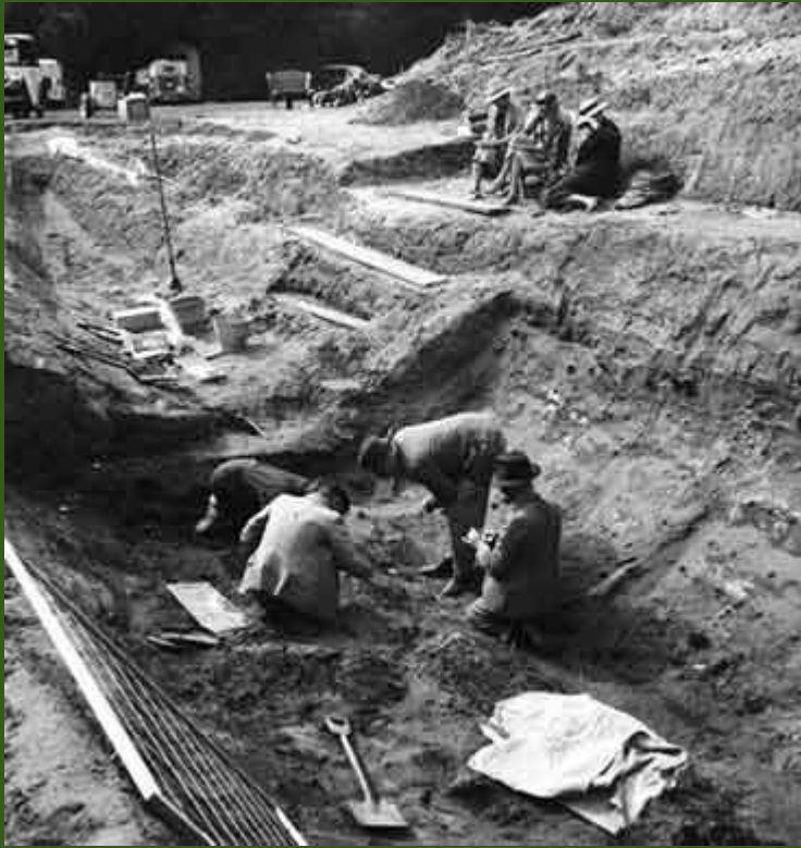
Archaeologists in 1939