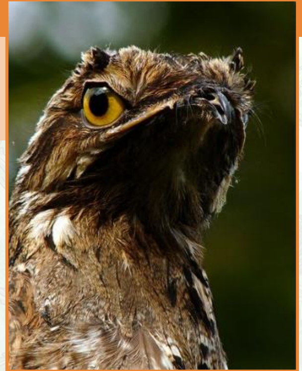
"Mrs. Moon" by julian londono is licensed under CC BY 2.0