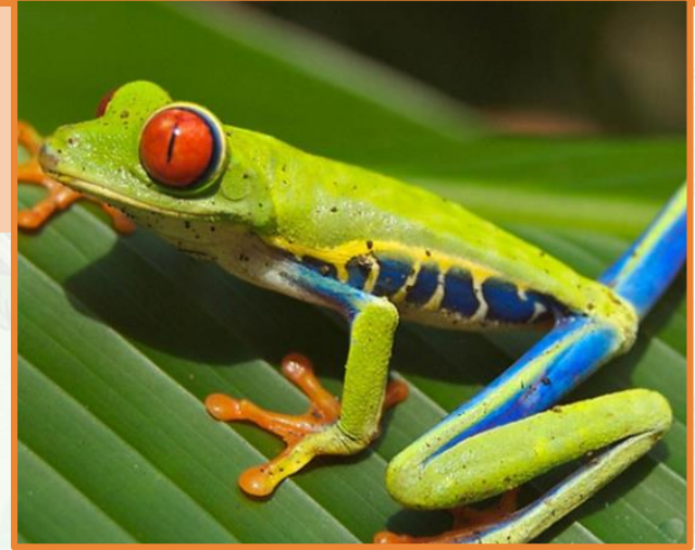
"Red Eyed Tree Frog" by Douglas Tofoli is licensed under CC BY 2.0