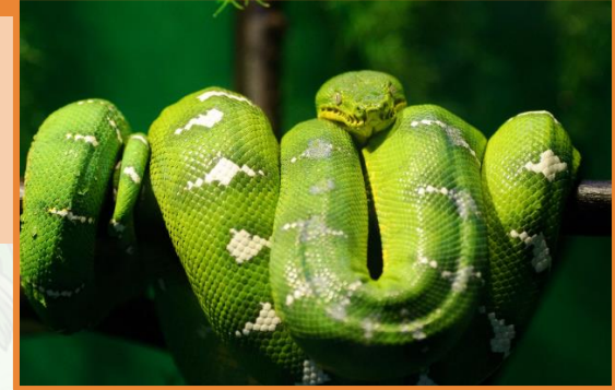
"Emerald Tree Boa" by Eric Kilby is licensed under CC BY 2.0