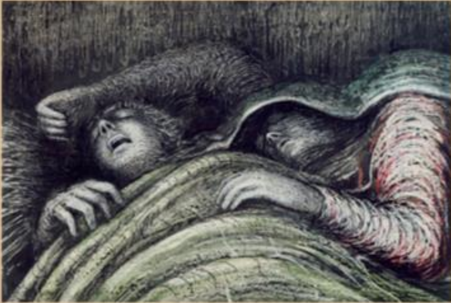
Henry Moore - Pink and Green Sleepers (1941)