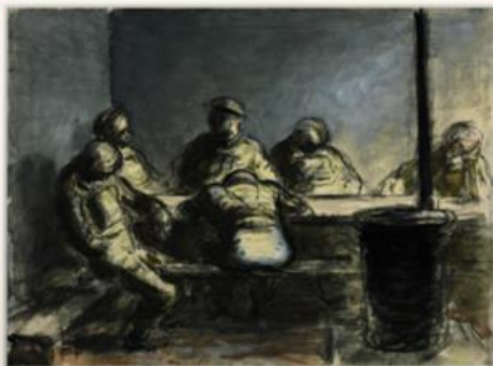
Edward Ardizzone - On a Fortified Island (1941)