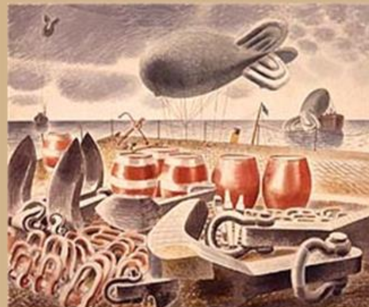
Eric Ravilious - Barrage Balloons at Sea (1940)