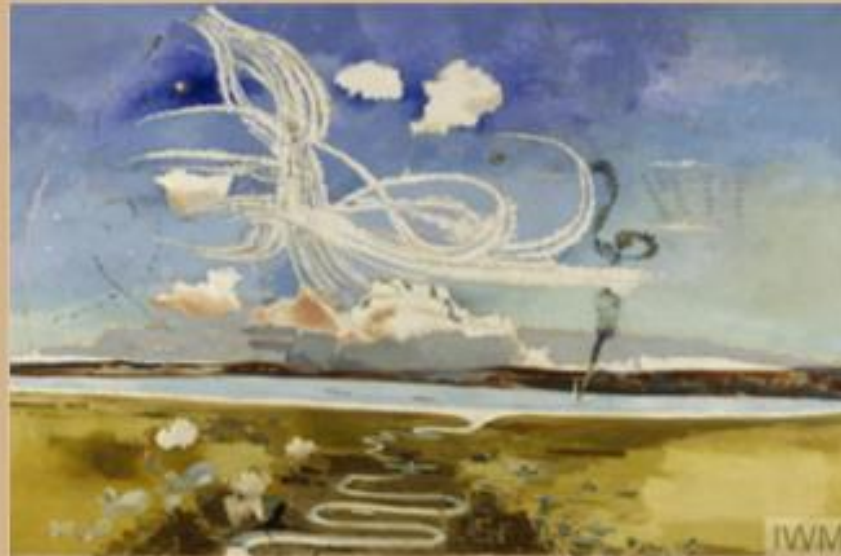
Paul Nash - Battle of Britain (1941)