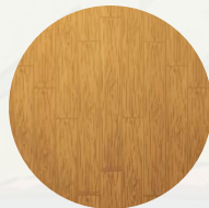
shiny wooden floor